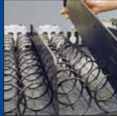
Flexible enough for all your product packaging.