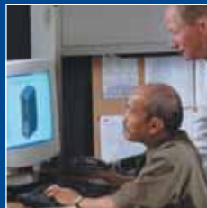
Engineered for years of profitable service.