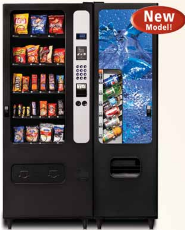
Compact 23/6 Refreshment Center 23 Select Snack & 6 Select Cold Drink Amazing versatility and variety for the smaller location!

Perfect for locations serving 35-55 customers.