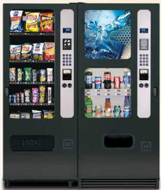
Compact 23/10 Refreshment Center 23 Select Snack & 10 Select Cold Drink Our Most Popular Combination!

Perfect for locations serving 35-55 customers.