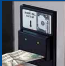
$ Bill acceptors standard and card reader ready.