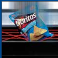
Customer friendly features including money back sensor systems.